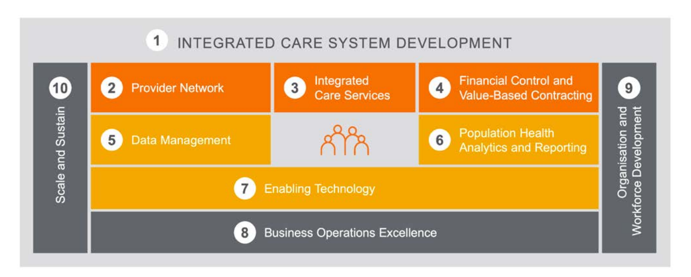
Figure 1. Optum's 10 Step Framework for Integrated Care System Development

This strategic framework is based on a model of integrated care and strategic commissioning that starts with the population and its needs at the centre. This model has been validated and used throughout the NHSE/I Commissioning Capability Programme as the underpinning strategic model and as such aligns with national policy.