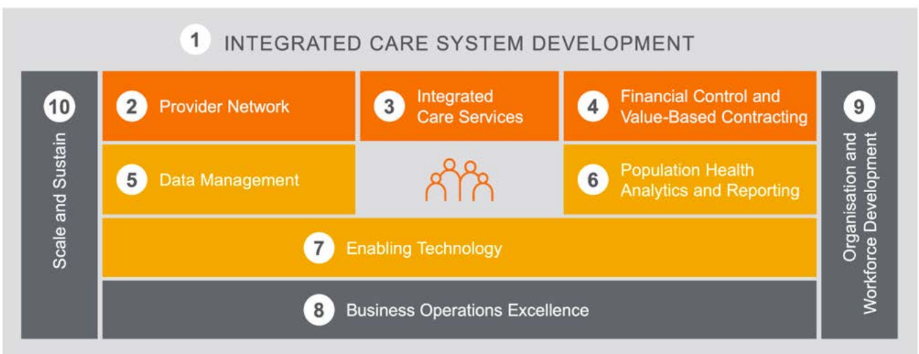
Figure 1. Optum’s 10 Step Framework for Integrated Care System Development

This strategic framework is based on a model of integrated care and strategic commissioning that starts with the population and its needs at the centre. This model has been validated and used throughout the NHSE/I Commissioning Capability Programme as the underpinning strategic model and as such aligns with national policy.